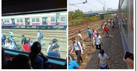
Mumbai: On Wednesday morning, local train services on Western Railway came to a grinding halt after a technical snag was reported in the overhead wire between Dahisar and Borivali suburban stations.

THE OVERHEAD WIRE SNAPPED BETWEEN DAHISAR AND BORIVALI ON UP [TOWARDS CHURCHGATE] A FAST LINE ON WEDNESDAY MORNING. THREE TRAINS HAVE BEEN HELD UP AND OTHERS ARE BEING DIVERTED.